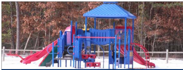
OUR NEW PLAYGROUND!

CDCH Charter School (K - Grade 5) provides PUBLIC SCHOOL CHOICE at no cost to families.